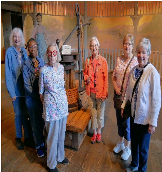
Endacott retirees touring the Steamboat Arabia museum via Out-of-town-travel.