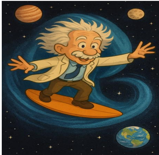
Graphic by Dave & ChatGPT.

LIGO - Catch a wave and you're sitting on top of the world (Beach Boys 1963)