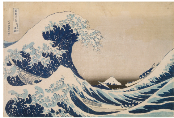
Katsushika Hokusai, 神奈川沖波裏 Kanagawa oki nami ura (The Great Wave off Kanagawa), circa 1829–1833, color woodcut, William Bridges Thayer Memorial, collection of the Spencer Museum of Art, 0000.1027.