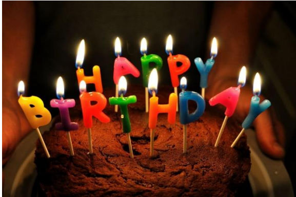
Birthday Cake

Happy birthday to you Happy birthday to you Happy birthday dear Retirees Happy birthday to you!