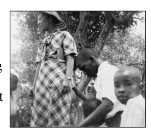
Zora Neale Huston in 1935

Directed by Tracy Heather Strain, this new documentary is an in-depth biography of the influential author whose groundbreaking anthropological work challenged assumptions about race, gender, and cultural superiority that had defined the field in the 19th century. Raised in Eatonville, Fla.,