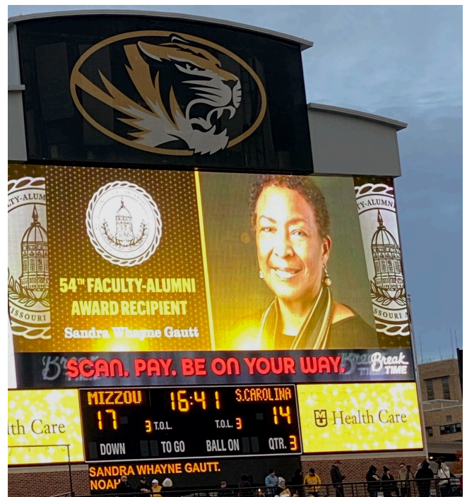
The Tiger scoreboard of MU's Faurot Field at Memorial Stadium in Columbia, Mo., announced the 54th Faculty Alumni Award to fans during the Nov. 13 football game.