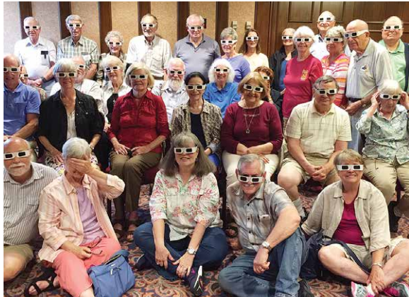
Solar eclipse 2017

The monthly newsletter includes specific dates, times and descriptions for the following events: